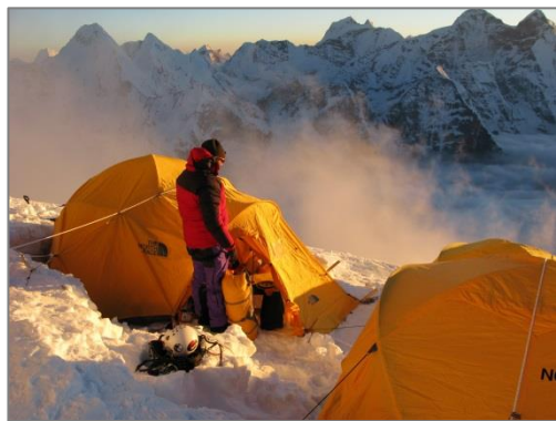
Camped high on Ama Dablam.

From Kathmandu, we fly by helicopter or fixed-wing plane directly to Lukla and follow the Khumbu Valley to Namche Bazaar. Acclimatising along the way and relishing in the hospitality provided by our Sherpa friends, we reach Base Camp (4,529m) and after some rest and preparation, we begin the ascent.