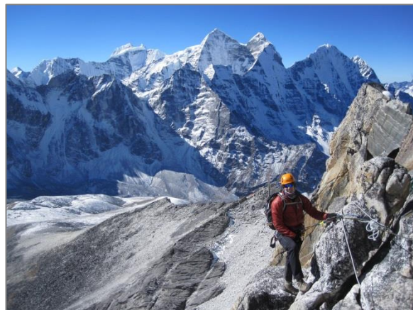
Negotiating a section of fixed ropes.

Ample supplies will be available to support all members. Guides and Sherpas will carry all group gear but members are expected to carry their own personal gear. Lightweight hand-held radios will be used to coordinate the movements on the mountain and provide a safety back-up for the lead team.