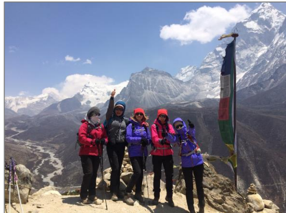
Trekking towards Everest Base Camp.

After our 'Everest experience' we trek to the Base Camp for Island Peak via a high alpine pass, the Kongma La and on to the village of Chukhung in the Imja Khola Valley. The pass crossing provides some of the best high-altitude views anywhere in the Himalaya! For those who would like a couple of easier trekking days, the option is available to hike around to Chhukung via Pheriche and Dingboche with a staff member and there is also the option to camp at Island Peak Base Camp.