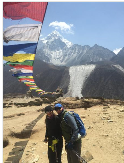
Combining exceptional scenery and cultural experiences in the Khumbu.

We make our way slowly up the valley, stopping for a few days in Namche Bazaar to enjoy the markets and to explore the local villages. We make a day trip to Thame, the last outpost on the ancient trading route over the Nangpa La, a pass between Nepal and Tibet.